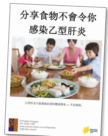
MHCS Awards 2013 Winner / NGO / Under $5,000 / Poster - Hepatitis B Myth Buster Poster Series