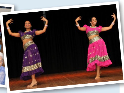
Monsuun Dance Group Performance

An International Women's Day Chai Party was organised by SAHELI, the Australian Hindi Indian Association, NSW Multicultural Health Communication Service and Hornsby Shire Council to promote the 2015 theme "Make it happen".