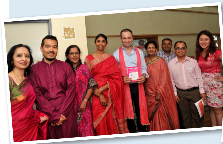
Matt Kean MP Member for Hornsby with Pink Sari Project volunteers, event participants and MHCS staff

https://www.facebook.com/thepinksariproject