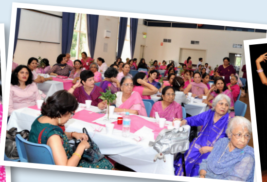
Attendees taking in breast screen messages