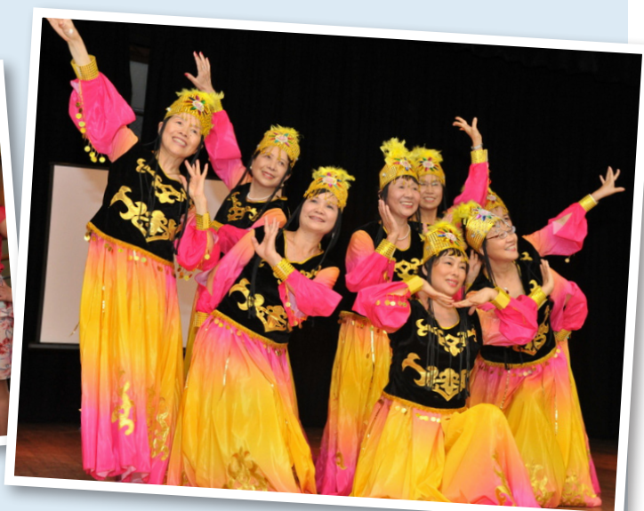
Chinese Line Dance Performance group